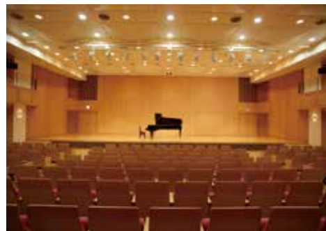
Meion Hall (Meion Concert Hall)