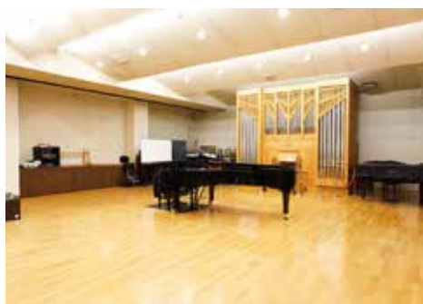
Large Concert Room (C101)