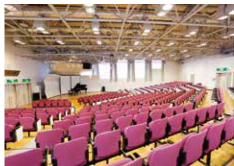
Large Hall (G1201)