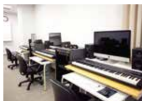
Audio Visual Room