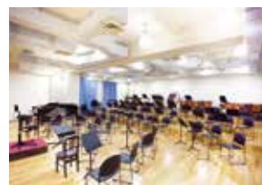
Orchestra Practice Room (D101)